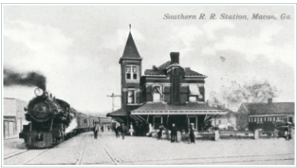
Southern R. R. Station, Macon, Ga.